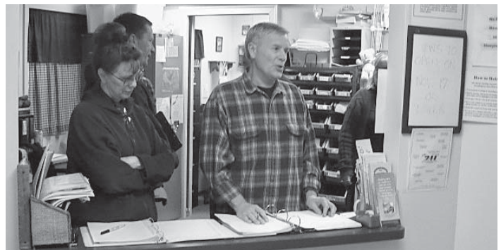
Cold Weather Shelter Volunteers

Additional volunteers to serve as receptionists, answer phone calls, make referrals and provide intake for clients. 301-631-2670.